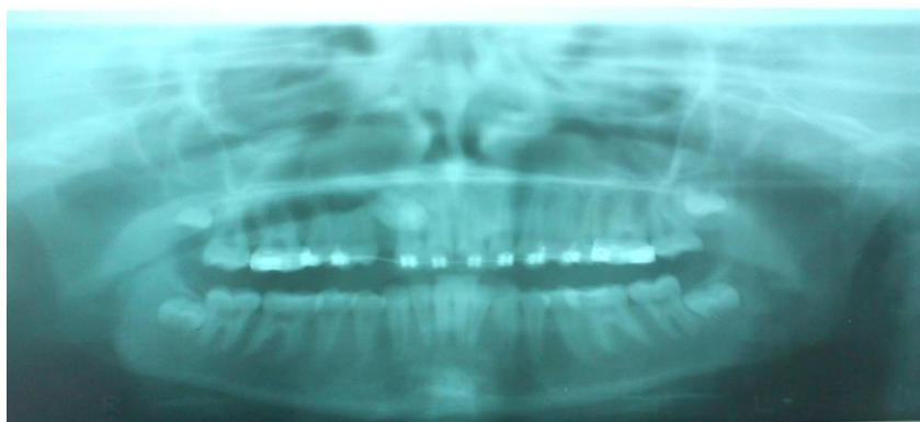
Picture 1. X-rays, Panoramix

After pulling up the mucoperiosteal flap, the position of the canine was palatal. Corticotomy was performed by using a drill number 5 and was made deep in the cortical bone and extended to spongiosa. The mucoperiosteal flap was sutured with non-resorbable silk sutures, taking care to preserve the interdental papilla. The excision around the tooth was made and protective barrier was placed. The regular check-ups were made on days 2, 7 and 10 after surgery. The sutures were removed after 10 days.