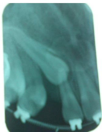
Picture 2. Retroalveolar X-ray