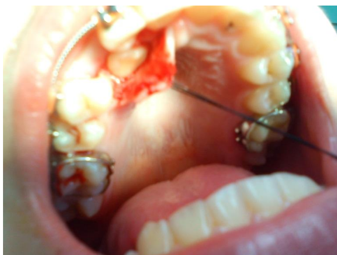
Picture 4. Mucoperiosteal flap