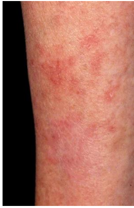
Figure 1. Maculo-papular rash.