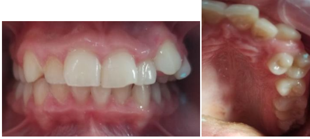
Figure 2. Intraoral view of the patient