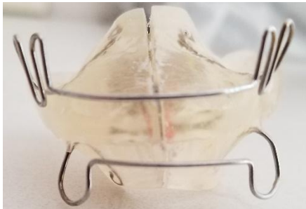
Figure 3. Myofunctional individual orthodontic appliance

Thus, we agreed that the best plan of orthodontic treatment in this patient was to change the poor oral habits and to improve oral dysfunction.