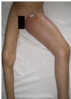
Figure 3. Swollen left thigh with increased volume and redness

leg, inability to move, increased local temperature, swelling and overlying skin erythema are shown in Figure 3. Left thigh circumference rapidly increased.