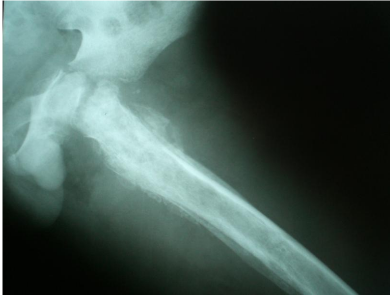
Figure 1. The anteroposterior radiograph shows altered skeletal structure of the left proximal femur metadiaphysis with osteolytic and osteosclerotic changes, a pronounced periosteal reaction, and marginal irregularity of metaphysis.

Plain radiographic findings and CT scan of the left thigh and femur confirmed the diagnosis of osteomyelitis, shown in Figure 1 and Figure 2. Doppler echo of the blood vessels of the left leg detected deep vein thrombosis.