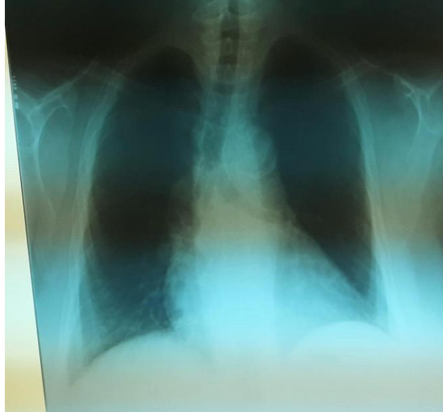
Figure 3. Chest x-ray after being discharged