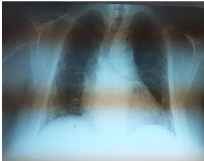
Figure 1. Chest x-ray on admission

A chest x-ray that was performed on a day of admission showed: On both sides, in the middle and basal parts of the lung parenchyma, zones of reduced lung transparency due to pronounced bronchitic and bronchiectasis changes, spotted fibrous banded shadows that are diffusely distributed. The changes are more pronounced on the left, perichilar, pericardial, and costal, a finding suspicious of an inflammatory process present. Pronounced hills, large, vascular and stagnant. F.c. sinuses free. Heart with increased cardiothoracic index [Figure 1].